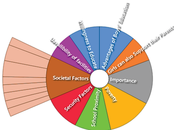
Figure 1: Themes

This section organizes the different themes and sub-themes emerged in the result of analyzing the transcriptions. From this perspective, figure 1 displays the identified themes including poverty, school proximity, security factors, societal factors, unavailability of facilities, willingness to educate, advantages of boys education, girls’ supporting their parents, and importance of girls.